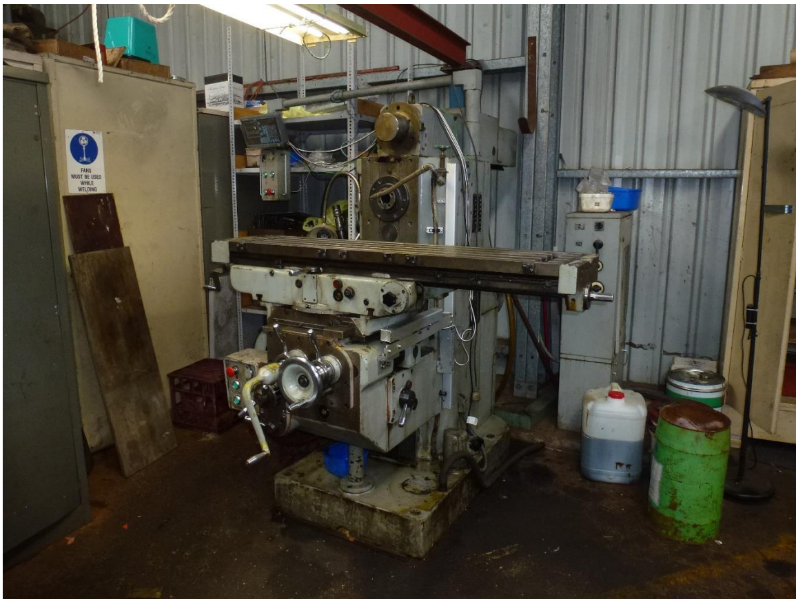
The Polish Milling Machine and its replaced Clutch.