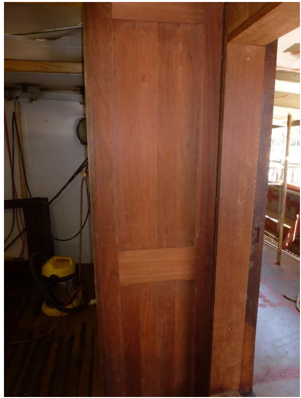
New unpainted panel same style