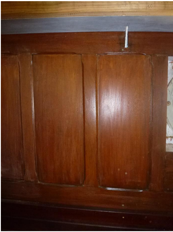
Pilots Saloon restored panel