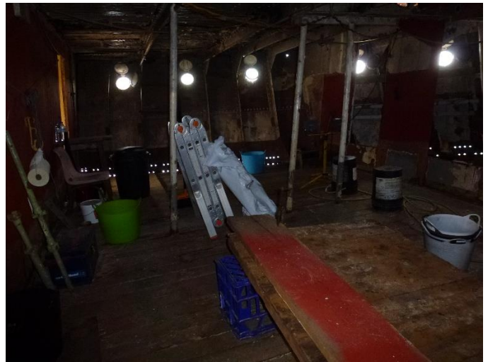
Forecastle awaiting restoration and associated internal areas of crew mess and accommodation. Looks bad but easily restored and quickly fitted out.