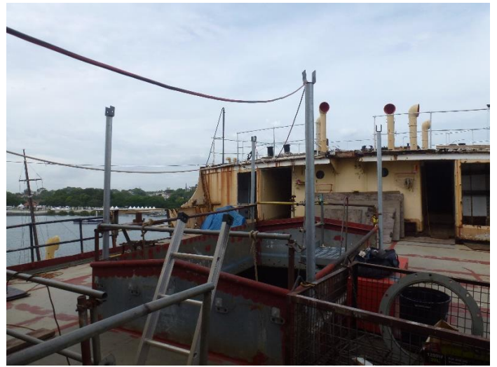
Upper Hatch Cover which sits on the four high steel supports seen above.