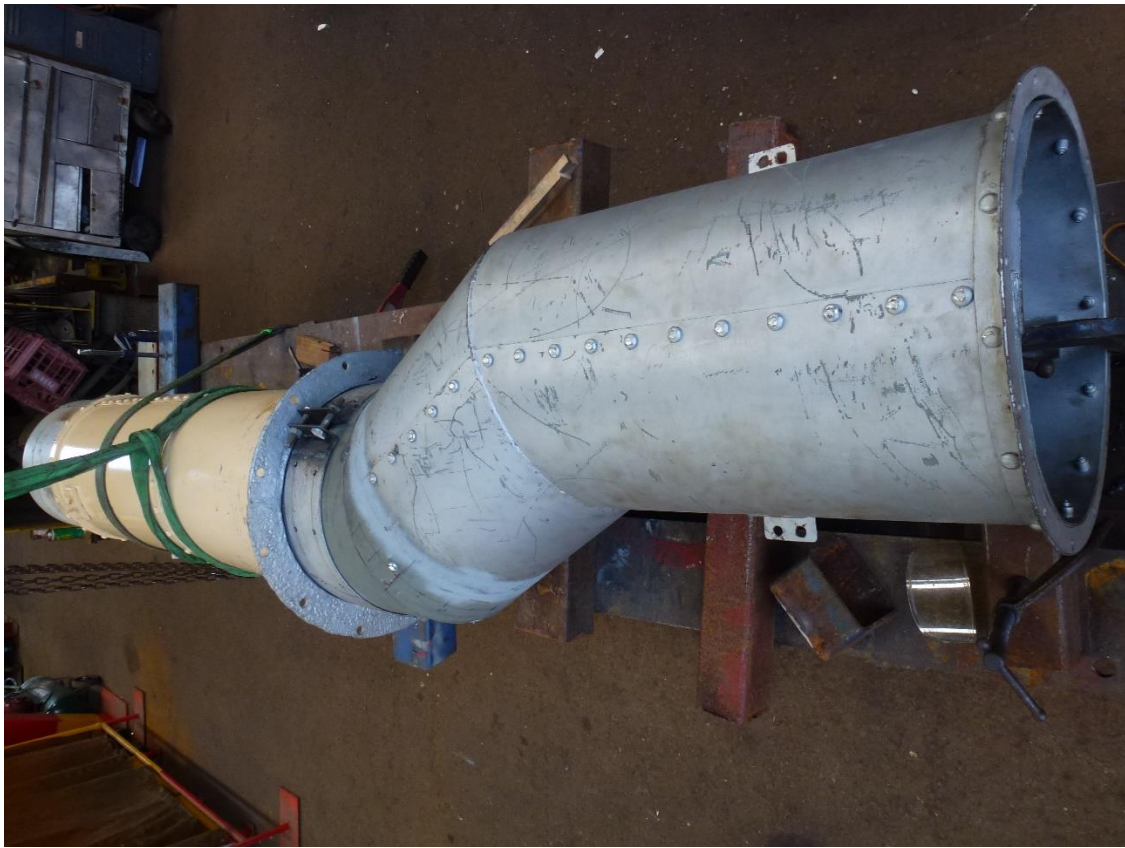
An Intricate vent needed a lot of work to make.