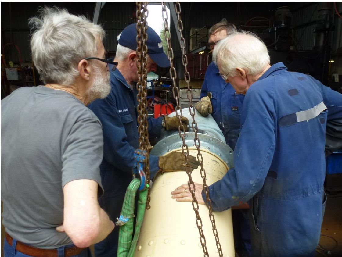
The expert Workshop Fabrication Team—think tank