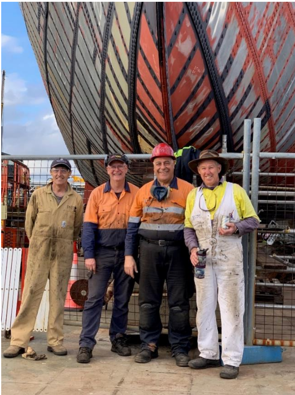
Some of the fabulous Caulking Company personalities