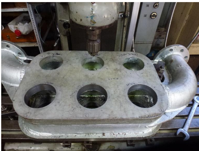
Returned from Galvanisers.