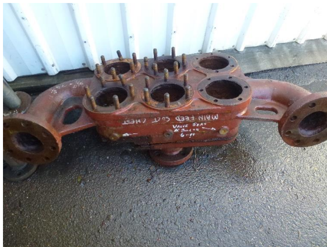
Old Feed Suction Chest beyond repair.

The following pictures support the progress achieved. Michael Schultz 22nd July 2019.