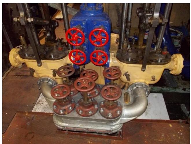
Passed the pressure test now up into the air by crane and lowered into the engine room.