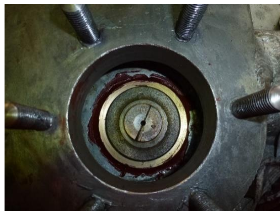
One of six valves being fitted.