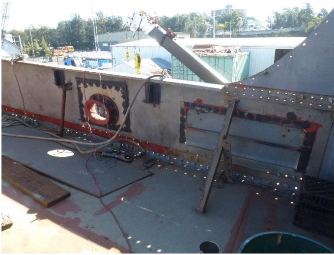
Fabrication Teams New Bullwarks Starboard side.